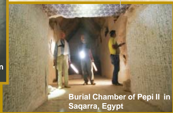
Burial Chamber of Pepi II in Saqqara, Egypt