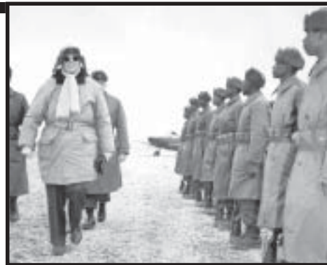
General of the Army Douglas MacArthur is shown inspecting troops of the 24th Infantry on his arrival at Kimpo airfield for a tour of the battlefield.

KOREA: The Never-Ending War airs on 3-2 Monday, the 29th at 8:00 p.m. On 3-1, it airs late night Monday, the 30th at 12:00 midnight and in early May, Sunday, the 5th at 9:00 p.m.