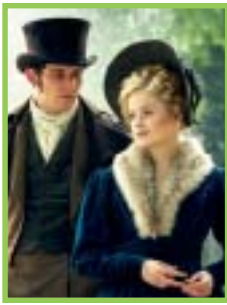
Marius and Cosette