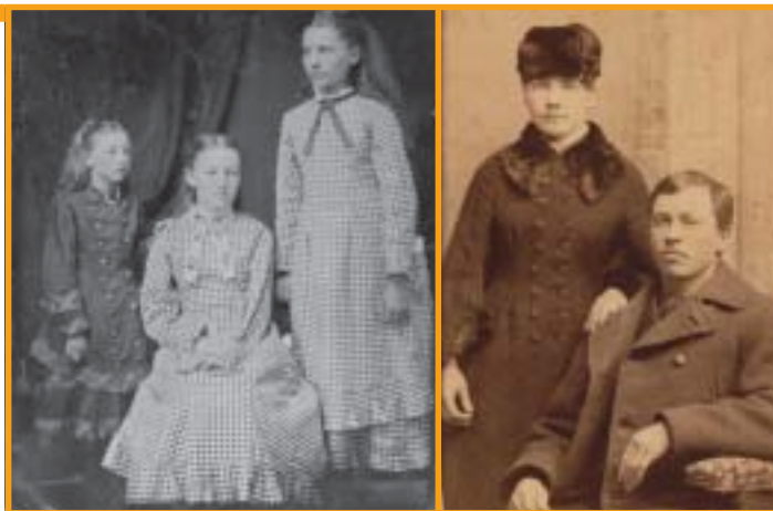
LtoR: Carrie, Mary and Laura Ingalls, c. 1879, and Laura and Almanzo Wilder, c. 1885

Starting with Little House in the Big Woods (1932), the books chronicle the adventures of a family struggling to survive on the American frontier and have inspired four generations with the courage and determination of their heroine. Though Wilder's stories emphasized real life and celebrated stoicism, she omitted the grimmer and contradictory details of her personal history: grinding poverty, government assistance, deprivation and the death of her infant son. In recent years, Wilder's depictions of American Indians and Black people have stirred controversy, and made her less appealing to some readers, teachers and librarians.