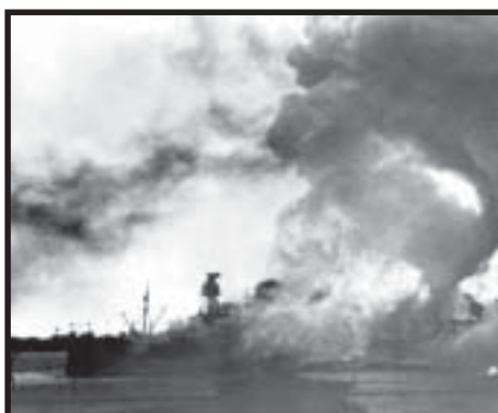
The USS Arizona is ablaze, just after her forward magazines exploded. The bow of the USS Vestal is visible at the left.

Remember Pearl Harbor airs on 3-2 Monday, the 7th at 8:00 p.m. See it on 3-1 Sunday, the 6th at 10:30 p.m.