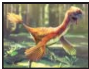
Caudipteryx was a small feathered dinosaur that couldn't fly. Its fossils were a goldmine for those studying the evolution of birds.

They are the most iconic animals on Earth—whales and birds of prey, ferocious crocodiles and magnificent elephants. To see