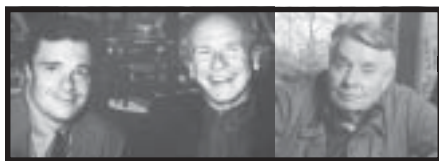
(LtoR:) Nathan Lane, Terrence McNally and Robert Shaw