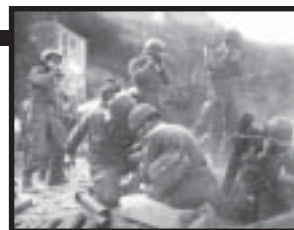
American mortar crew in action near the Rhine, 1945

Secrets of the Dead "World War Speed" will be broadcast on 3-2 Tuesday, the 25th at 7:00 p.m., Wednesday, the 26th at 9:00 p.m. and Sunday, the 30th at 10:00 a.m. On 3-1, it airs Wednesday, the 26th at 8:00 p.m.